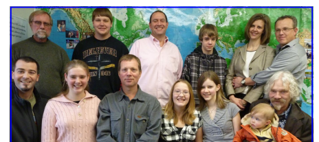
a few team members....